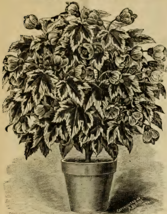
SOUVENIR DE BONNE.

New Abutilon, Souvenir de Bonne. —One of the most valuable novelties of recent years, and totally distinct. It is a very strong grower. The leaves, a beautiful green, are regularly banded with gold, the flower stem is eight to nine inches long, the bloom very large and bright orange-red in color. A beautiful decorative plant, being of fine tree shape. Price, 10 cents each; 50 cents per dozen; $3.50 per hundred.